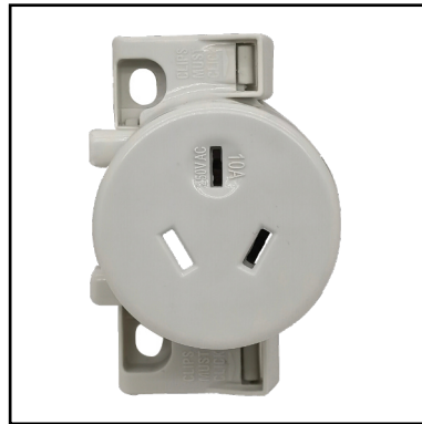
10Amp Quick Connect BMP-QC-10