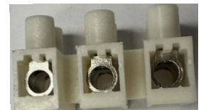
PA16H Large terminal Block